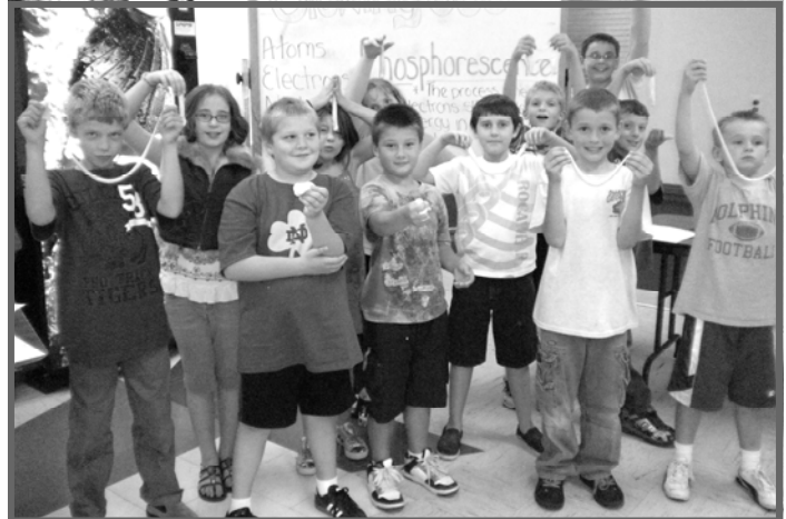
On September 23rd, 14 students attended the Glowing Goo After-School Program. All the participants learned about atoms, electrons, neutrons, protons, the nucleus, and how phosphorescence works in an atom. In the end, each student successfully made their very own GLOWING GOO!